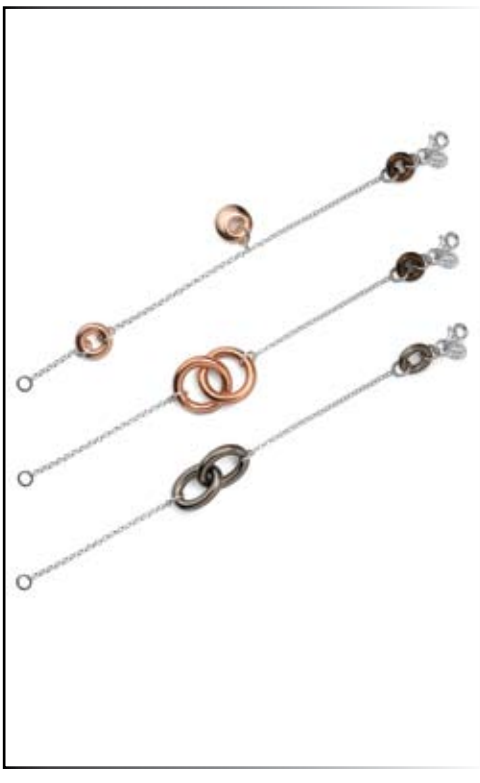
bracelets from £70

With Christmas just around the corner, why not treat a loved one to a special gift? We have a wonderful array of gifts to inspire you and also offer all our clients a free gift-wrapping service.