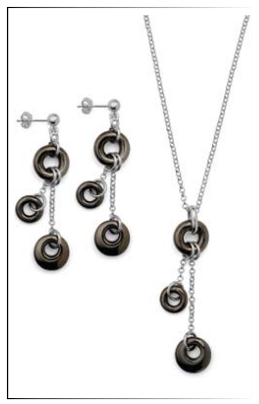
pendants £95 earrings £55