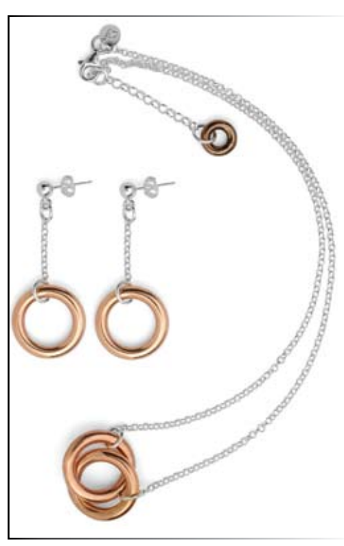
pendants £95 earrings £55